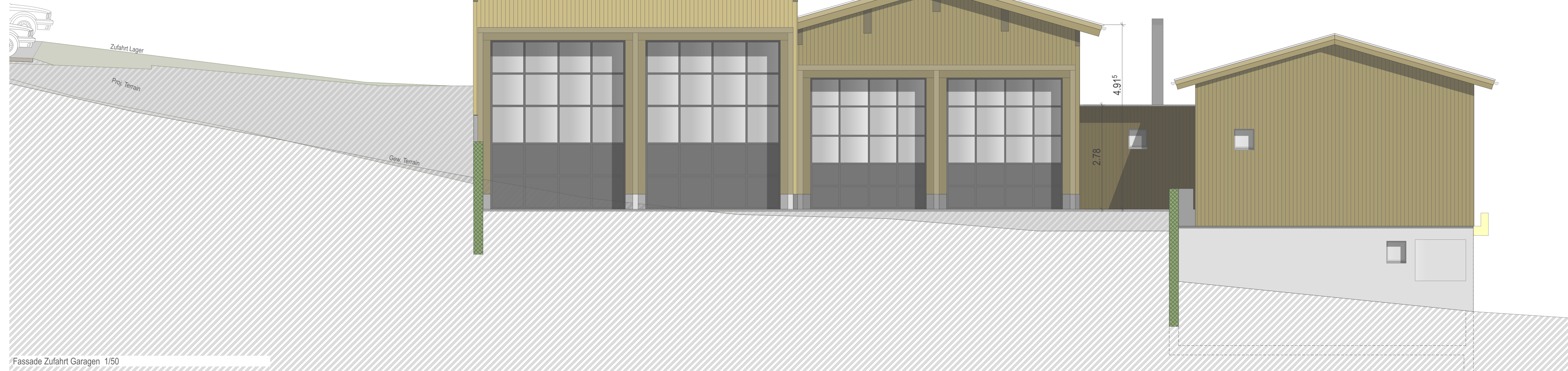
Fassade Zufahrt Garagen 1/50